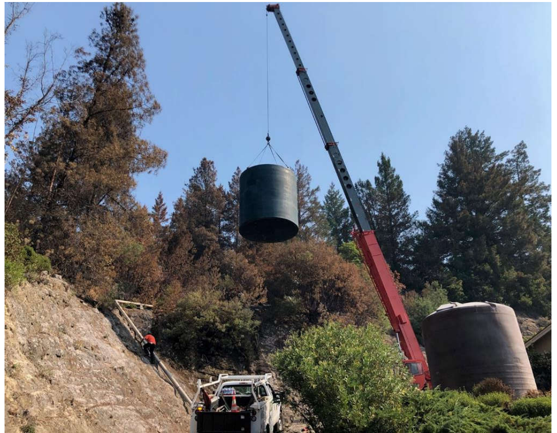
Blackstone Terrace required a crane to replace damaged tanks.