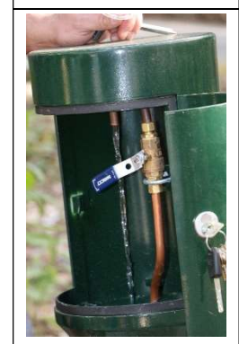
Water access to sample water for testing

SCADA is a computer system for gathering and analyzing real time data. SCADA systems are used to monitor and control water tank levels, high/low level alarms, start/stop pumps or equipment with remote monitoring. Project completed.