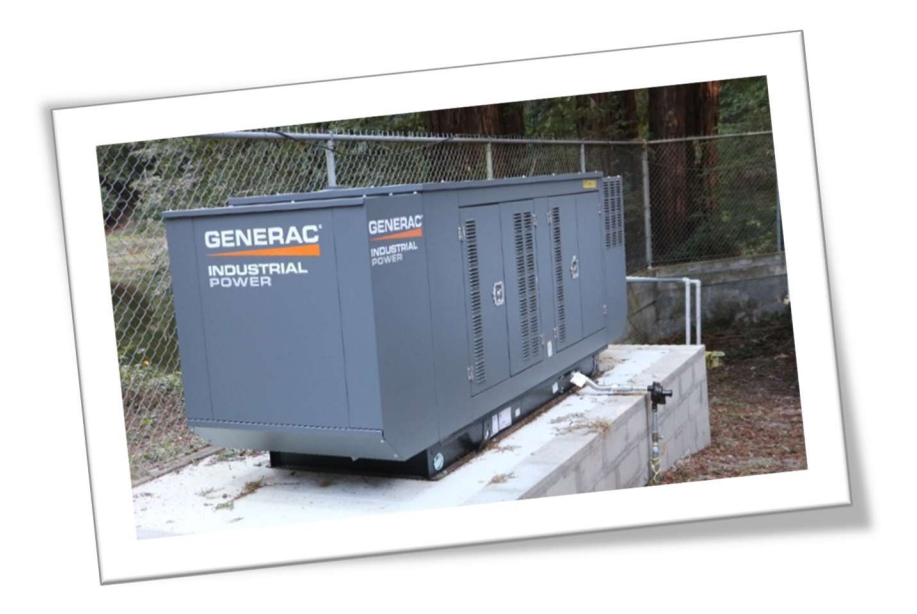
New Generator high enough to avoid water damage

LADOC page: https://www.slvwd.com/lompico-assessment-district