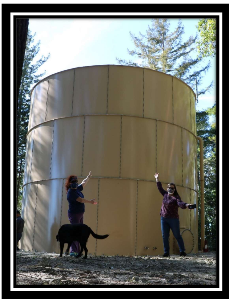
Madrone Site One of two Tanks FY 2021