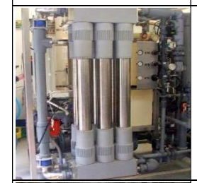
Mill Creek Water Treatment Plant

Not needed, being sold or repurposed. Please see District Manager report for further information.