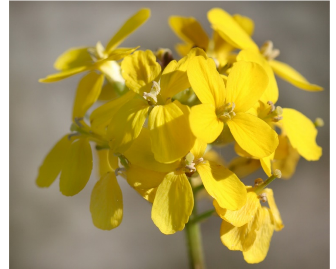
Ben Lomond Wallflower