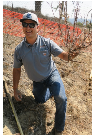
Director of Operations transplanting Buckwheat – Probation Tank 2019