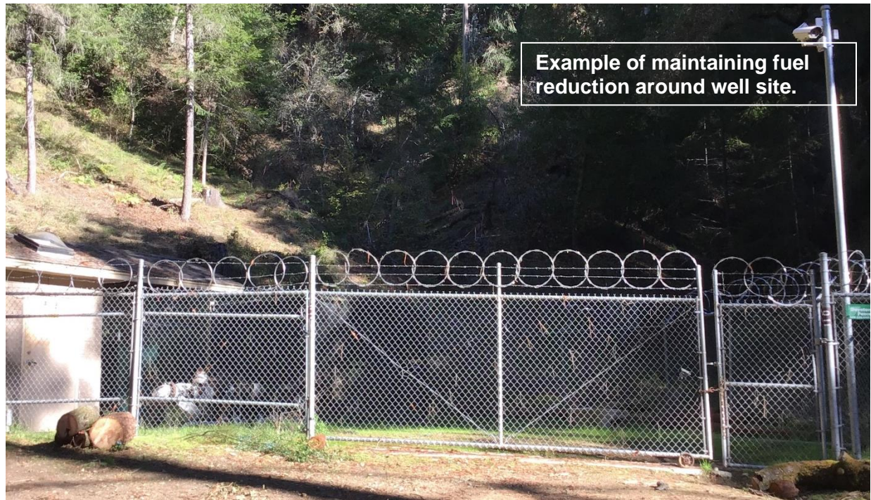
Example of maintaining fuel reduction around well site.