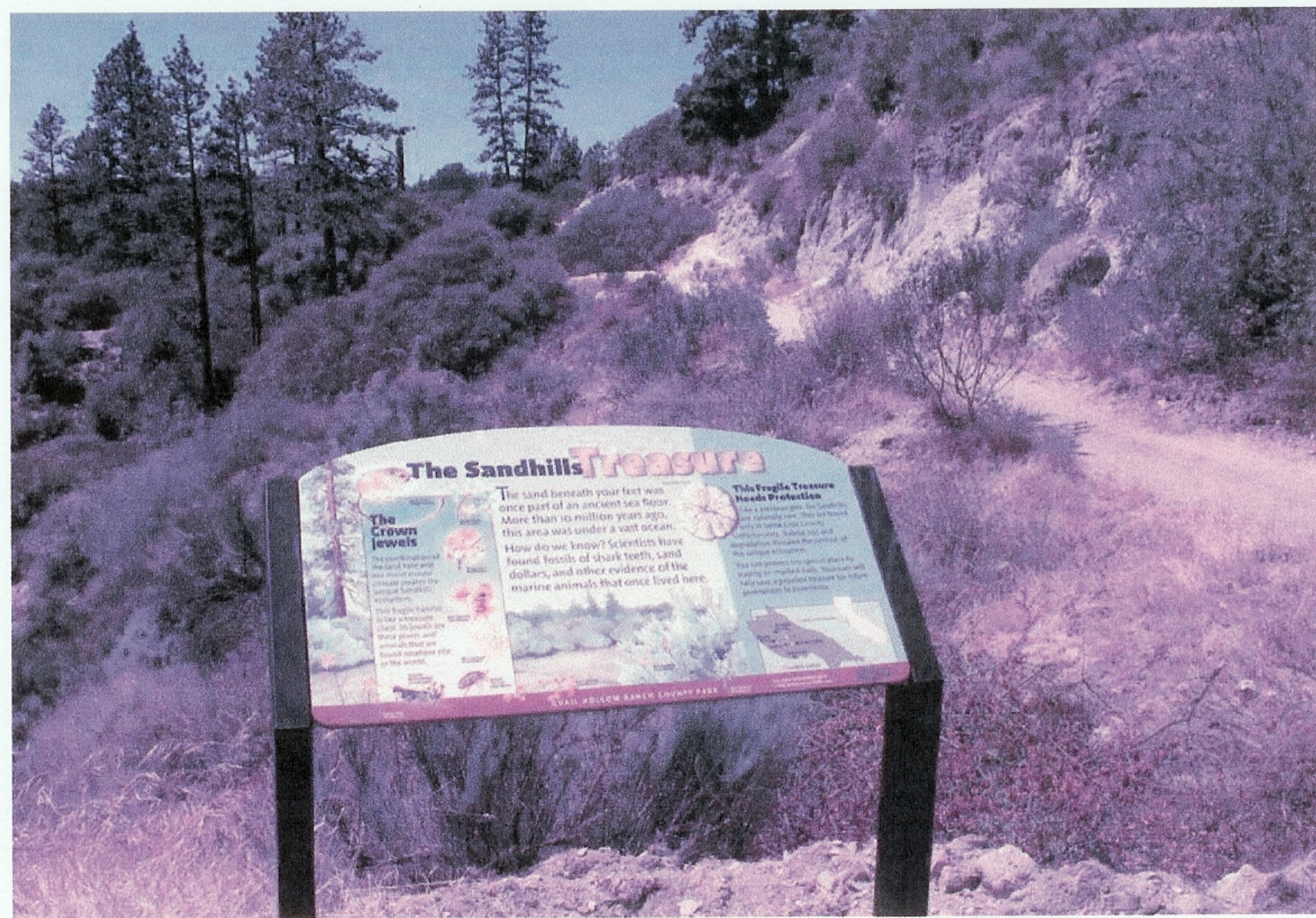
Images of the Sandhills Interpretive Panel, showing: a) the final panel design, b) the panel installed at Quail Hollow Ranch County Park, with Lee Summers, Park Naturalist, and c) the Quail Hollow Ranch County Park Panel along the Sunset Trail.